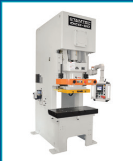
Gap Frame Presses

As one of the largest press builders in the world, Stamtec has been providing dependable, high-performance metal stamping presses for more than 40 years in North America and 70 years worldwide. We also provide fully integrated press production systems including servo coil-feeding lines, transfer systems, quick die change systems, etc. Our 72,000 sq. ft. sales, service, logistics, and assembly facility in Tennessee is home not only to North America's largest inventory of new presses and spare parts, but also our most important asset - our people. Our staff of engineering, sales, service, and support personnel are here to serve you in the most timely and professional manner. Please contact us any time for a free professional consultation about your press production needs. We'd welcome the opportunity to help you!