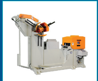
Coil Feeding & Handling Systems