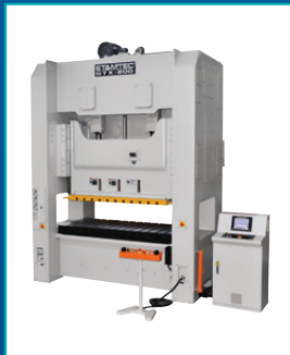
Straight Side Presses